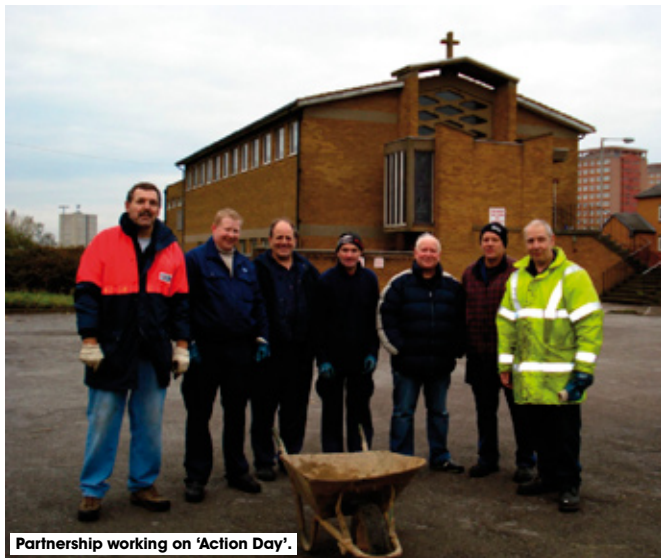
Partnership working on 'Action Day'.

The neighbourhood police team and local businesses in Newtown teamed up to tackle problems affecting the People's Chapel on Great King Street.