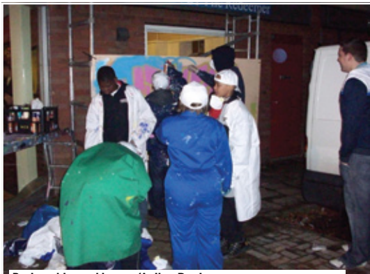
Partnership working on 'Action Day'.