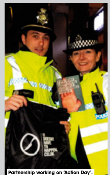
Partnership working on 'Action Day'.

Officers from Stechford operational command unit will continue to use search equipment at various locations as part of their activities to support the Home Office's Tackling Knives Action Programme (TKAP).